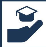
Education & Livelihood