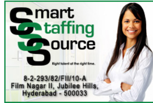
( http://smartstaffing.co.in/ )