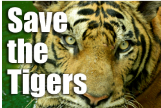
( http://tathya.in/social/tiger/ )