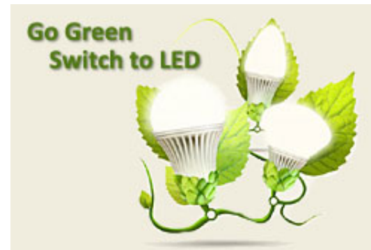
( http://tathya.in/bppi/ )