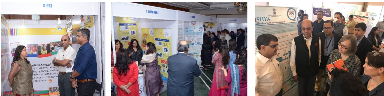
USAID Partner Stalls

The second half of the event was divided into three TED style speaker sessions by the USAID partners, on the theme " Partnerships for Scale and Impact ". A brief summary of the same is as follows: